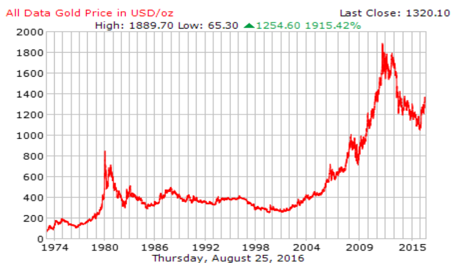
Fig. 1. Dynamics of gold prices in the period from 1973 until August 2016

Main trends of global alternative investements markets. In Figure 1 is presented the dynamics of international prices for an ounce of gold .