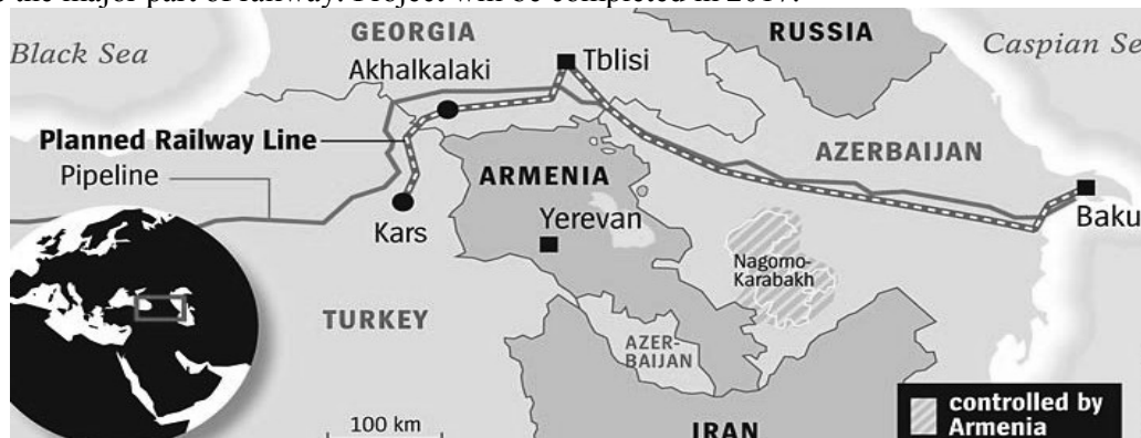
Map 5. Route of KTB Rail Project

KTB is a railway project to connect directly Turkey, Georgia and Azerbaijan (See Map 5). The total length of railway is 826 km and its total cost is around 450 million US$. Railway's 76 km will be built in Turkey, 259 km will be built in Georgia and the rest will be built in Azerbaijan. Accordingly Azerbaijan will have the major part of railway. Project will be completed in 2017.